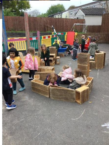
Foundation Stage playground