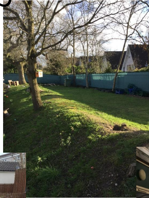
Foundation Stage woods