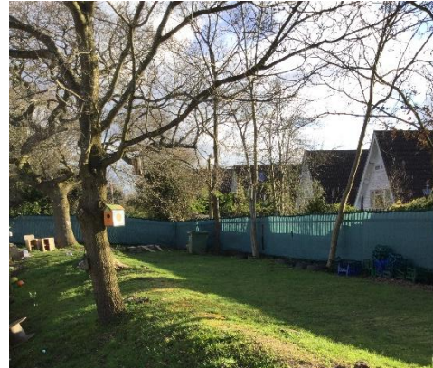
Foundation Stage Woods