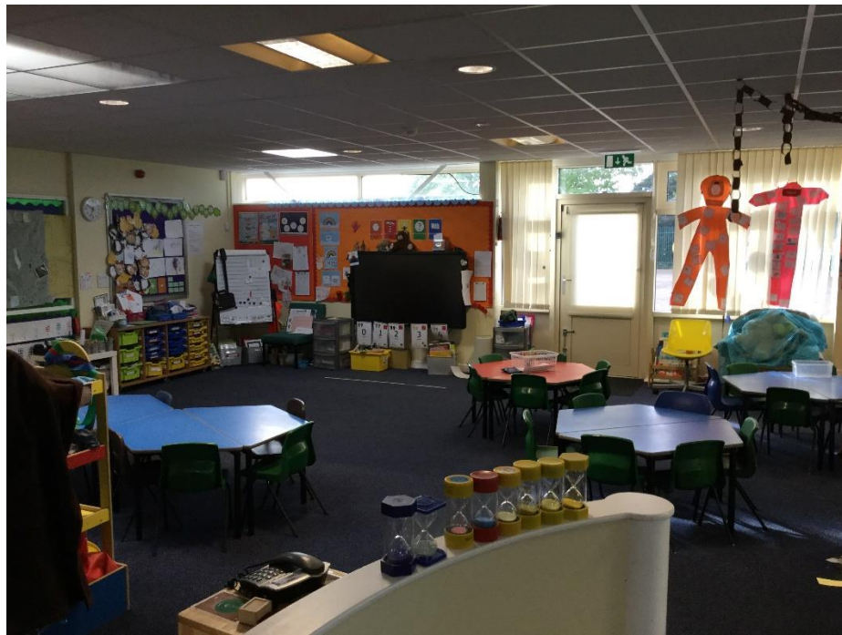
Reception class 1