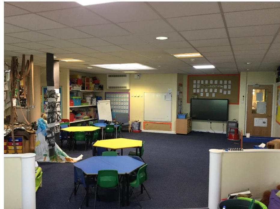
Reception class 2