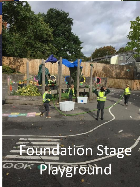
Foundation Stage Playground